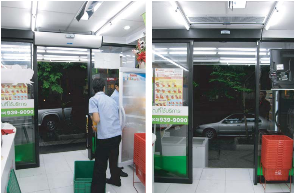
XQ vs. RQ: A wall-mount XQ-5S was replaced by a recessed RQ-5S at the same site.

The RQ-5S series of air curtains are made from galvanized steel with powder coating finish. They are designed to be installed concealed within false ceiling so the unit will be completely flushed to blend in with modern architecture.